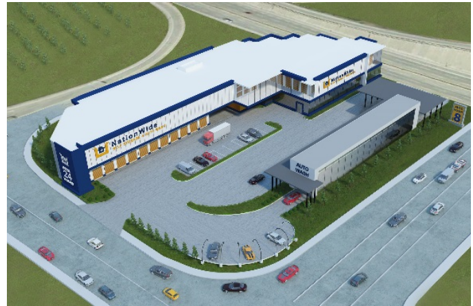
1500 Hugh Allan Drive, Kamloops, BC

As previously reported, CTA Design Group ("CTA") has been engaged by NationWide to provide both architectural and engineering services to the Kamloops property.